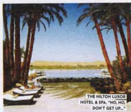
THE HILTON LUXOR HOTEL & SPA. "NO, NO, DON'T GET UP..."

Food? The Steinberger Nile Palace hotel in Luxor ( steinberger.com ) has a great Lebanese restaurant. And if you want to sight-see further afield, I'd recommend a week's Nile cruise to explore southern Egypt's wealth of temples and tombs followed by a week in a Red Sea Resort. Book now Discover Egypt (0844-880 0461, discoveregypt.co.uk ) offers seven nights at the Mercure Hotel for £499 including flights and transfers.