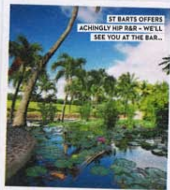
ST BARTS OFFERS ACHINGLY HIP R&R - WE'LL SEE YOU AT THE BAR...

As a treat I'll stay at the Hotel St Barth Isle De France ( isle-de-france.com ), or a private villa. Anse De Grand Saline is a stretch of mostly deserted beach where the odd boogie boarder and