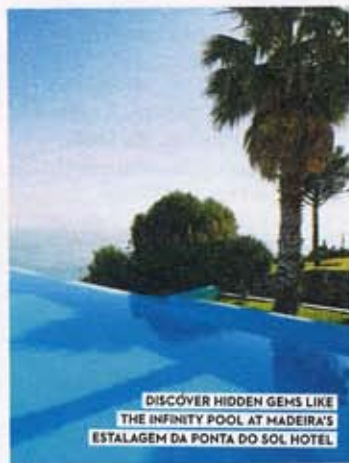
DISCOVER HIDDEN GEMS LIKE THE INFINITY POOL AT MADEIRA'S ESTALAGEM DA PONTA DO SOL HOTEL

"Madeira is now a trendy haven for Lisbon's young weekend crowd"