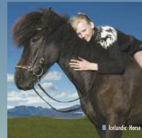
■ Icelandic Horse

History knits this city together. From the statue of Ingólfur Arnarson, the first settler, on the hill overlooking downtown, to Sólfar, a sculpture of a Viking boat that sits on the