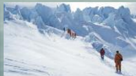
■ Vatnajökull Glacier