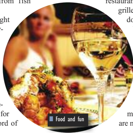
■ Food and fun

There was once a McDonalds in the centre of the city, but it closed down through lack of custom. It wasn't just that a meal cost £10; taste buds are made differently up here.