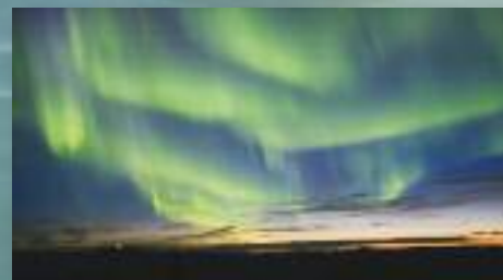
■ The Northern Lights