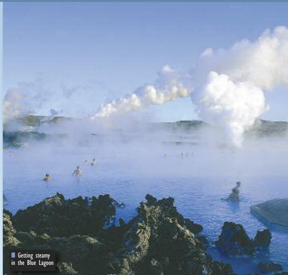
■ Getting steamy in the Blue Lagoon

study rating the most expensive cities in Europe put the city at 62, from a previous position at number five, making it the lowest featured city in Western Europe bar Manchester.