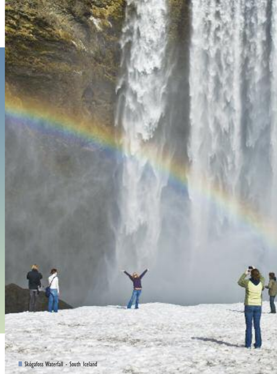
■ Skógafoss Waterfall - South Iceland