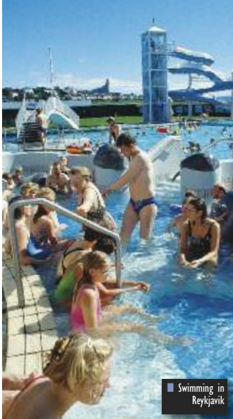
Swimming in Reykjavik