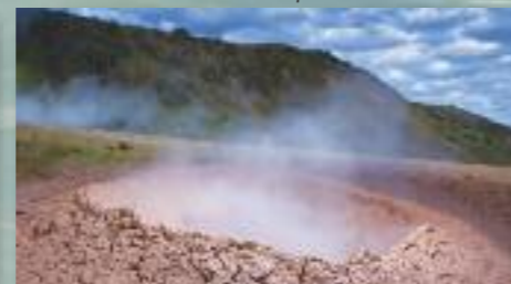
■ Hot springs near Hverageri town – South Iceland