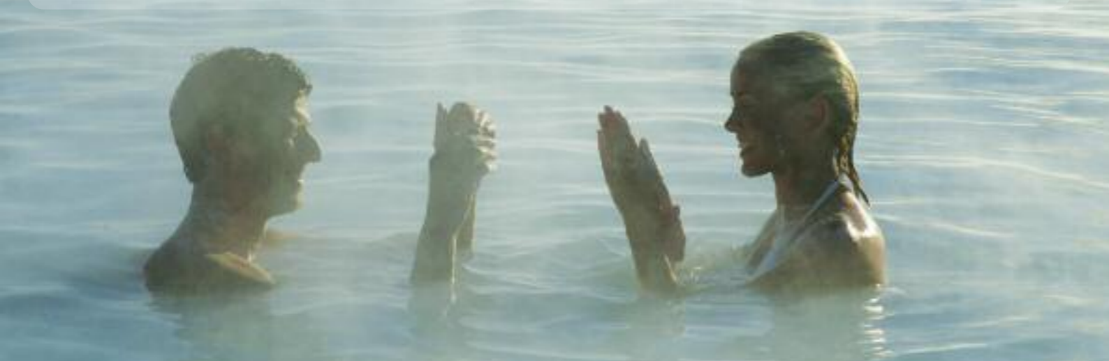
■ The Blue Lagoon

My love affair with Reykjavik started long before the economic crash, when a pint of beer still cost around £5 (it's now about £2). In January, The Economist's annual